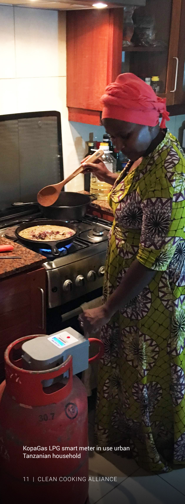
KopaGas LPG smart meter in use urban Tanzanian household

Concessional funding is also likely limited due to the perception that LPG is the domain of large-scale, commercial infrastructure investment (in contrast to biomass cookstoves which are typically viewed as the domain of the development community). These perceptions are worth challenging. Donors looking to stimulate the development and scale-up of high-impact solutions and sustainable models should realize that nascent LPG markets offer a viable energy transition solution.