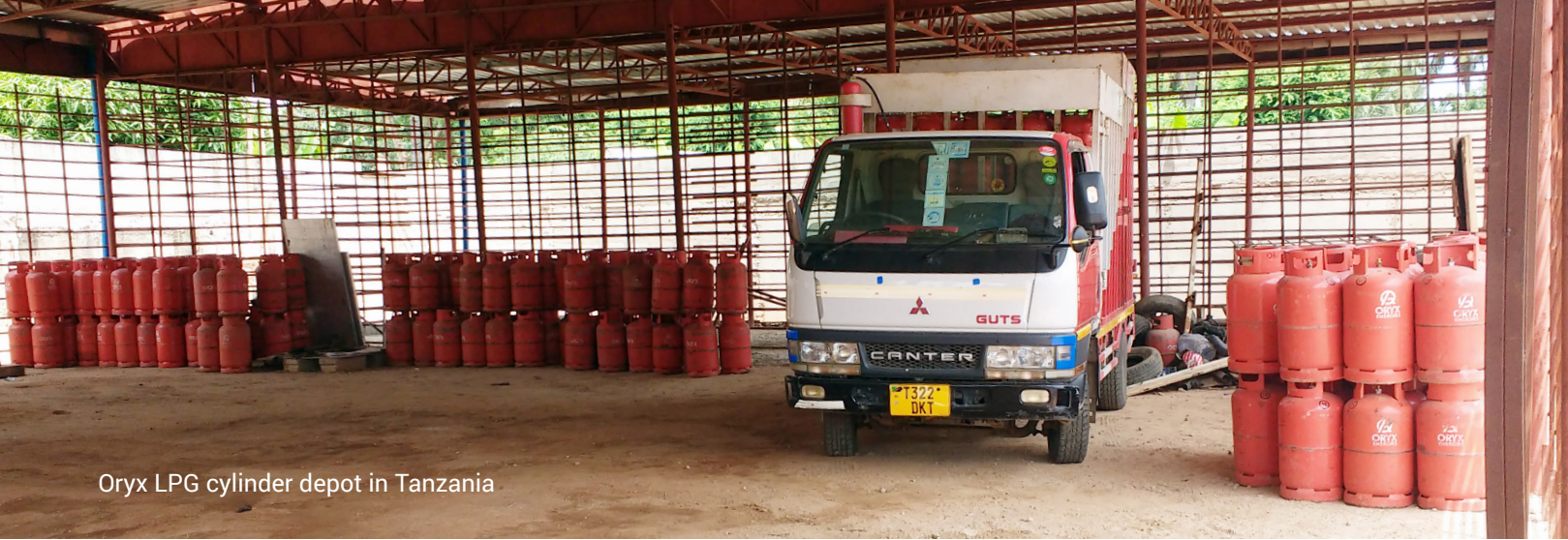
Oryx LPG cylinder depot in Tanzania