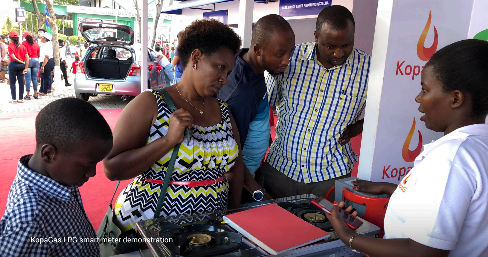
KopaGas LPG smart meter demonstration