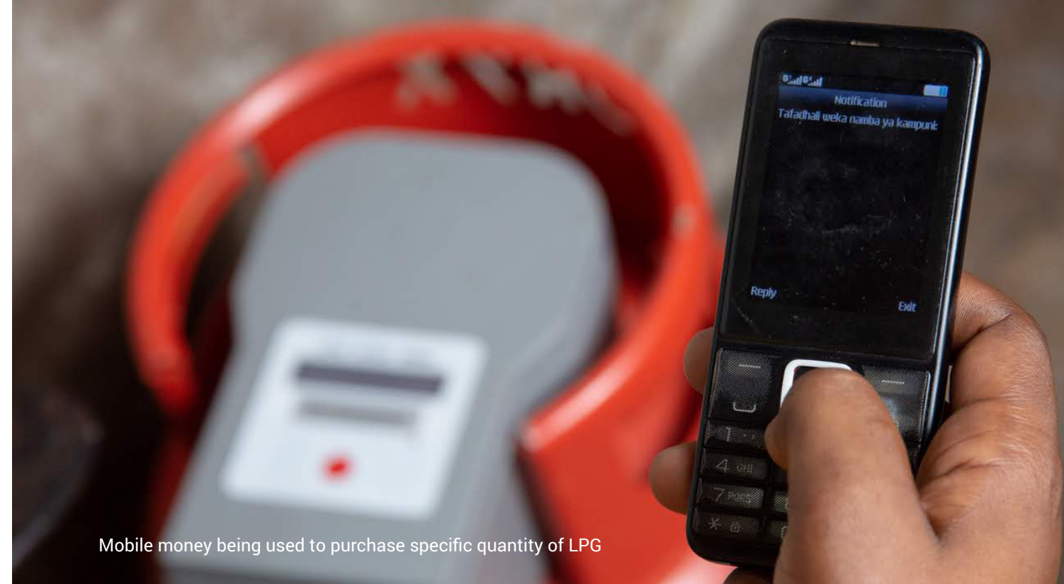
Mobile money being used to purchase specific quantity of LPG

» Distribution and customer services are more complex and costly in LPG PAYG than in PAYG solar. With any LPG model, PAYG or otherwise, customers require regular gas cylinders refills typically on a fortnightly or monthly basis. In contrast, solar products “refill” from the sun, and if maintained correctly can last several years with minimal after-sales service. LPG has additional quality control requirements around safety, handling, distribution, refilling, storage, and maintenance, as it is a combustible fuel.