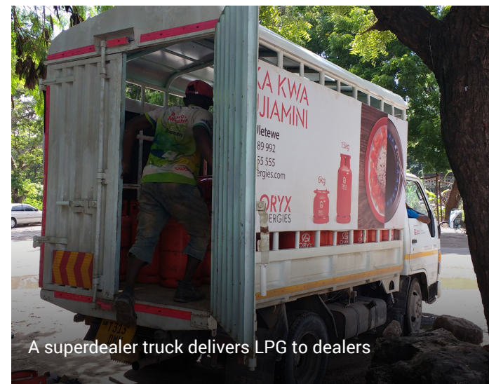
A superdealer truck delivers LPG to dealers

These storage facilities require substantial capital expenditures (“CapEx”), can take one to two years to construct, and require long-term, infrastructure-focused capital. Blended capital approaches which leverage public sector funding with private capital, concessional finance and grants, risk mitigation products, etc. can be advantageous given the current risk/return profile of such investments, but have not been readily accessible.