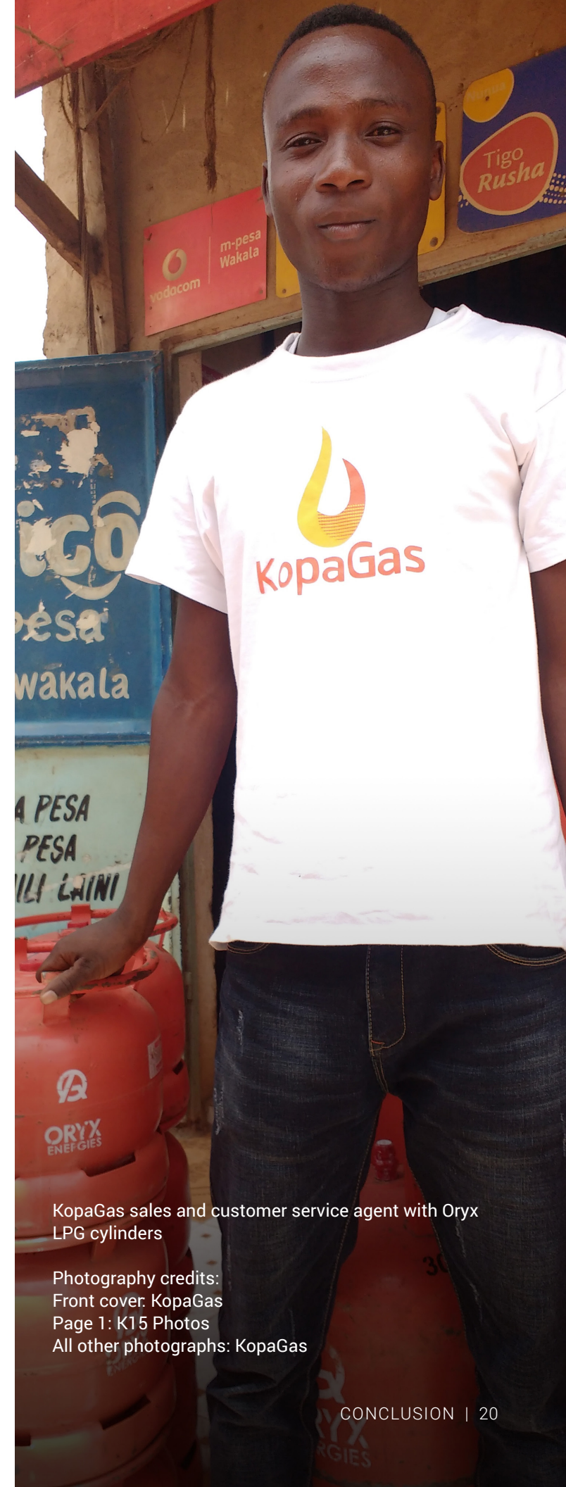
KopaGas sales and customer service agent with Oryx LPG cylinders

An investment fund which invests debt (and to a lesser degree equity) at all levels of the supply chain may be one avenue to accelerate the scale-up of LPG as a viable cooking fuel. No major funds have been established to specifically support the LPG sector, nor are there sufficient funds for clean cooking solutions that have LPG within their mandate. This is despite a strong base of evidence regarding the significant health and environmental benefits associated with a near-term transition to LPG for cooking. To accelerate growth, development partners should consider establishing investment facilities that focus on, or include in their mandate, the LPG supply chain. This is one area that the Clean Cooking Alliance continues to actively develop with its partners in markets around the world.