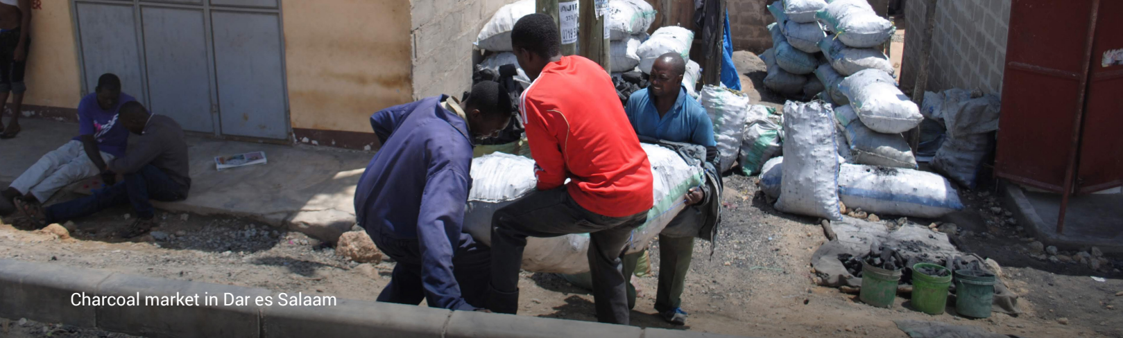
Charcoal market in Dar es Salaam

have all demonstrated a lack of sustainable LPG sector growth. The government of Ghana is currently transitioning as rapidly as possible from CCCM to BCRM to reduce deaths caused by LPG accidents and to attract investment to scale up its LPG industry [7]. In Colombia, legitimate market participants lost control over cylinders and widespread illegal filling occurred under the historical CCCM regime. In response, Colombia has since become the model of successful and rapid BCRM adoption [8].