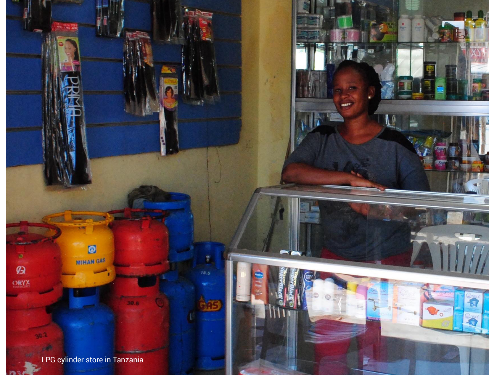
LPG cylinder store in Tanzania

A proper communication strategy is also necessary to ensure consumers fully understand policies. This is especially true for subsidies that target low-income households and require customer identification. If subsidies are properly explained, customers will know if they are eligible and will not feel the process is overly complicated.