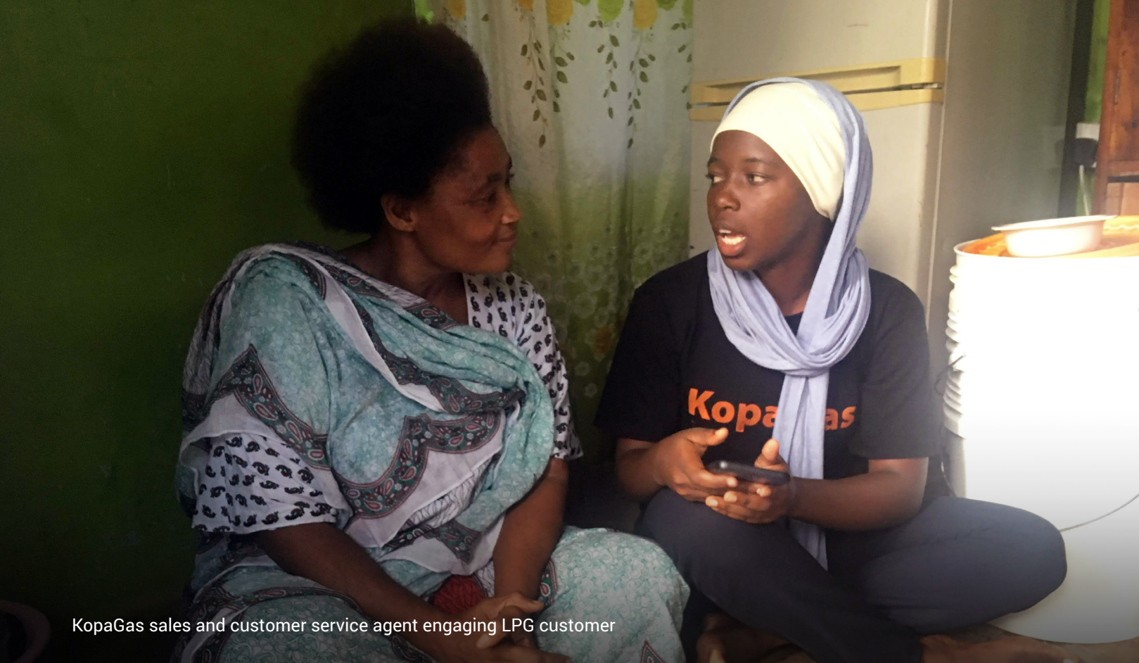
KopaGas sales and customer service agent engaging LPG customer